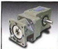
High Torque Gearheads