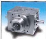
Spiral Bevel Gearboxes